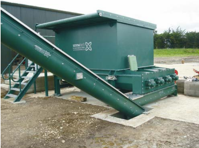
Above: Concept Solutions feed hopper and conveyor installed at the Envirocomp nappy composting plant

HotRot Organic Solutions has a philosophy of providing environmental technology based on sustainable business relationships. When we select supplier partners we look for people and companies who are interested in the long term development of their products to meet our clients' needs.