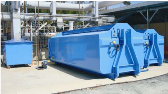
Left: A Concept Solutions Screwtech self levelling storage bin in Brisbane, Australia